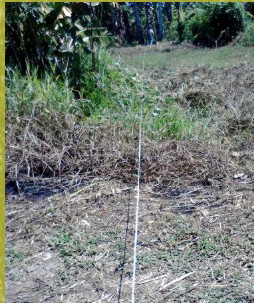
Cutting and marking a boundary line.