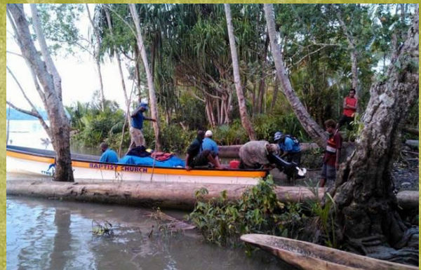
The men students leaving on the Kikori outreach.