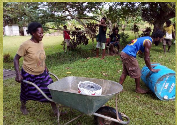
Barge delivery of fuel and fencing wire!